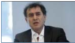
Market bear Roubini sticks to dour forecasts