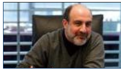
Blog: Taleb's necessary and impossible wish-list