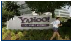
Yahoo's plan: Create community from isolated sites